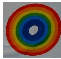
Wu-Wo Tea Flag