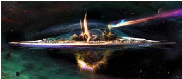
Asgard (Movie: Thor)