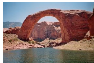
Rainbow Bridge, Utah

What is curious to me in all of this is how the Norse actually seem to be remembering (in my opinion, as all ancient people's do), fragments of the truth that they once knew when the peoples of the world were all in one place.