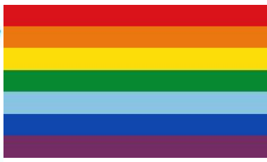
Flag of the city of Cusco