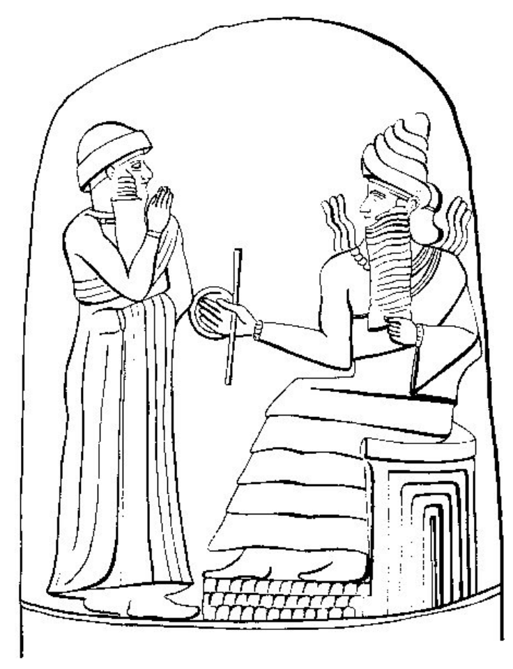
Left: Code of Hammurabi (front). Right: Relief from the black diorite stele on which the Code of Hammurabi (18th century b.c.) is engraved (now in the Louvre, Paris): The sun–god (note the rays) installs Hammurabi as king by handing him the royal insignia (scepter and ring) and with them the task of establishing and guaranteeing social order with just laws.<sup>2</sup>