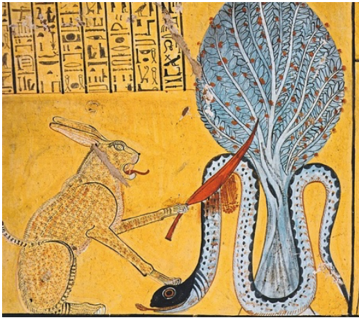
Ra in the form of the Great Tom Cat slaying Apophis under the Ished tree Tomb of Inherkha